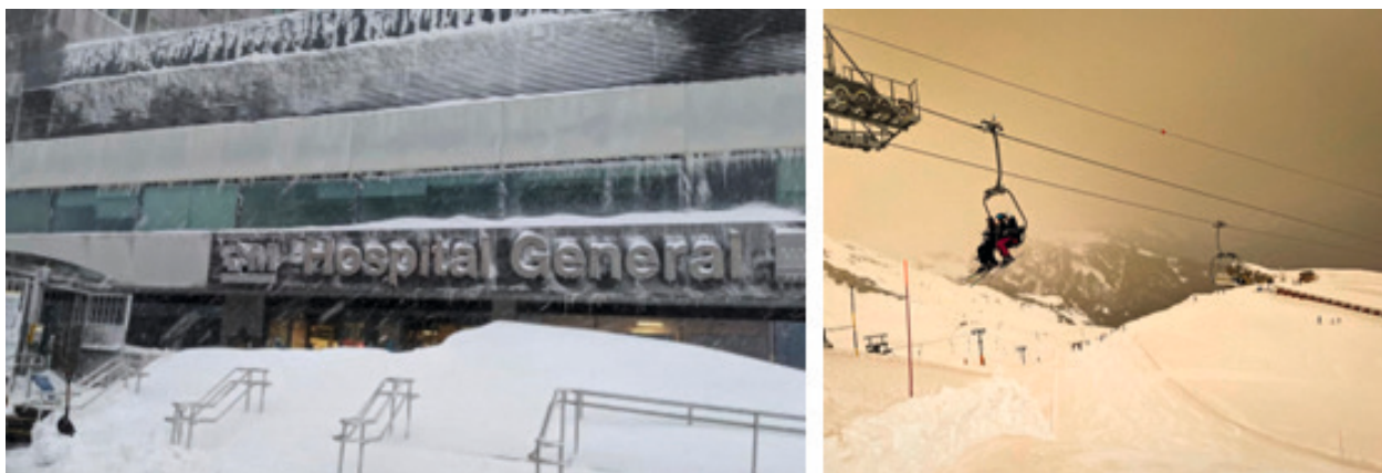
Figure 1. A (left): Access to the main entrance of Hospital Gregorio Marañón (Madrid, Spain), during Storm Filomena. B (right): Saharan dust storm at a ski resort.

deaths, more than 10,000 missing people, the devastation of metropolitan areas, and a paradoxical increase in health risks due to lack of potable water. Behind the severity of Cyclone Daniel was the enormous amount of water vapor emitted by the Mediterranean due to its abnormally high summer temperatures (close to 30°C).