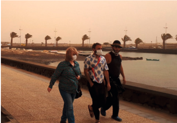
Figure 2. Photograph taken in Arrecife, Lanzarote (Canary Islands, Spain), on 22 February 2020 during the Saharan dust surge that affected the Canary Islands (author: Sergio Rodríguez).

– Preventing climate-change-related health risks in the workplace.