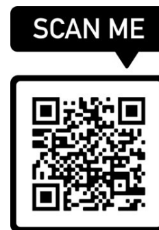
Figure 3. Clinical tool for stratifying severity in patients with pulmonary involvement due to COVID-19.

This study has several limitations. First, as a multi-center study, there was considerable variability in COVID-19 prevalence. Second, inter-operator variability, which was minimized by standardizing the examination and including only physicians experienced in clinical ultrasound. Third, the possibility of false positives or negatives during the early pandemic period due to the initial performance of PCR tests. Despite these limitations, we conclude that scales integrating LUS with clinical or laboratory data may be useful to predict and anticipate which patients are likely